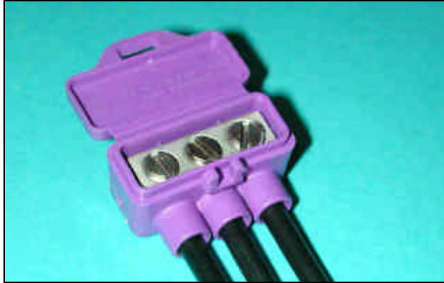
FIGURE 4 - King Innovation "AlumiConn" Connector

In mid-2006 a new connector became widely available for the aluminum wire pigtail application. This connector is shown in Figure 4. An initial set of tests on this connector has been completed. (These test results will be presented, published, and made publicly available in September, 2007.[13])