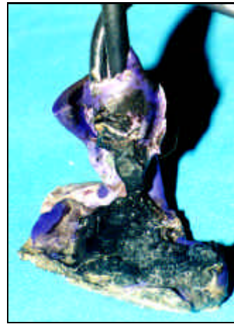
B. SEVERE FAILURE, PLASTIC SHELL MELTED AND CHARRED. THE CHARRING INDICATES THAT IT HAD PROBABLY IGNITED.