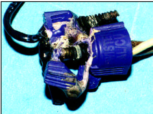
A. THESE TWO FAILED SPLICES ARE ADHERED TOGETHER BY THE MELTED PLASTIC SHELLS

Additionally, field burnouts have now been reported with the Ideal #65 connectors in their rated applications. With CPSC skeptical (and requesting that UL withdraw its listing), the manufacturer initially agreeing that the connector is not for the pigtail retrofit application, independent tests clearly demonstrating poor performance, and field failures reported, the use of the Ideal #65 "Twister" connector for the pigtail application is definitely not recommended. If the COPALUM repair is not available, use the AlumiConn connector (See Section 1C).