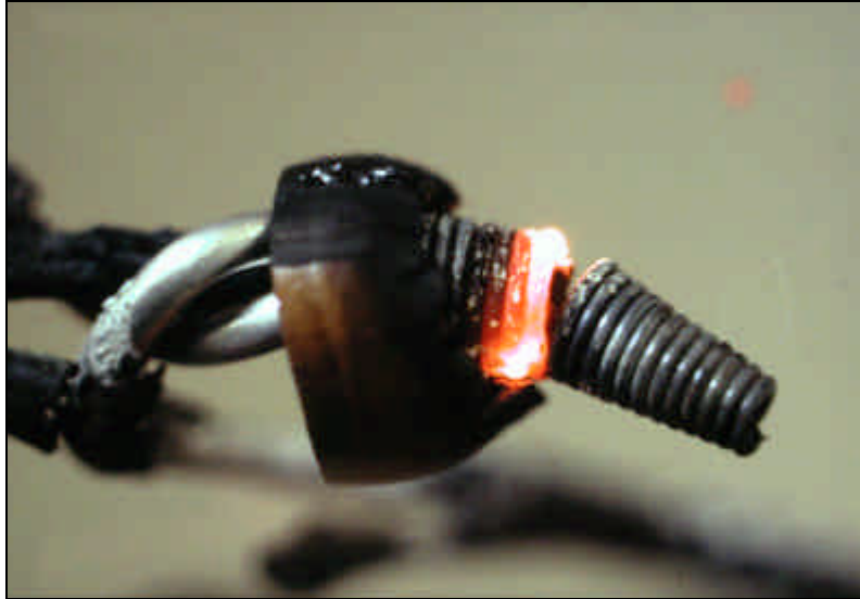
FIGURE 1 - ALUMINUM WIRE SPLICES MADE WITH TWIST-ON CONNECTORS CAN BE DANGEROUS. The use of most types of twist-on connectors with aluminum wire can lead to hazardous results. This twist-on pigtail connection (two #10 aluminum wires with one #12 copper wire, in a 20-amp circuit), made with a twist-on connector that was UL listed for use with aluminum wire at the time, remains electrically functional in the circuit, but it becomes extremely hot whenever a significant amount of current flows. The heat has deteriorated the insulation on both the connector and the wires. In this photo, a portion of the connector's spring is red hot, at current well below the circuit rating.